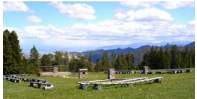
Mullan Pass Site 46°39'14.47"N 112°19'01.62"W

Friday Night Meet & Greet $30.00 Saturday Breakfast $15.00 Ladies Tour & Lunch $40.00 Men's Lunch $10.00 Saturday Night $30.00